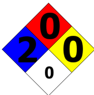
NFPA SCALE (0-4)